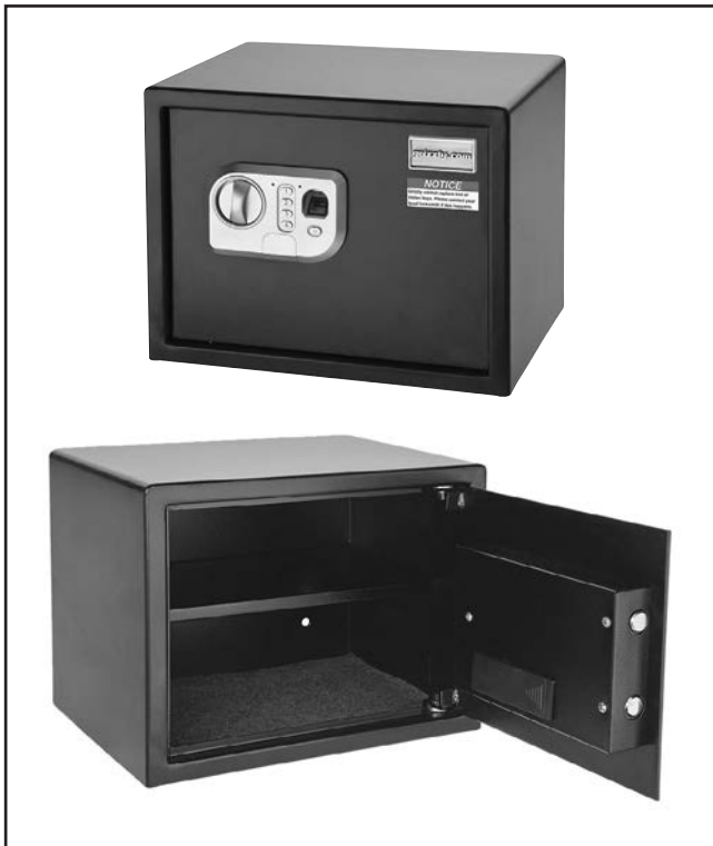
Figure 1. Model T10723 Fingerprint Safe.

This safe features a soft mat inside to protect secured items, a removable upper shelf, and mounting holes for securing to a wall or the floor.